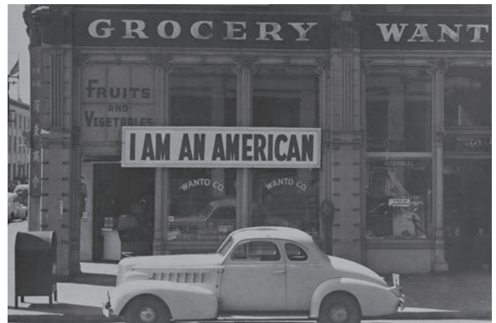
An original "I Am An American" sign that was displayed during WWII. The sign will serve as the centerpiece and focal point for the traveling exhibition.

The Nation Museum of the United States Army and the National Veterans Network (NVN) is currently seeking personal objects to include in the exhibition that will represent the Nisei Soldier's "I Am An American" theme. Personal artifacts and archival documents are integral to this storytelling exhibit approach. Photos, letters, diary entries or any items that show the Nisei Soldier expressing their identity as an American is of great interest during this time of discovery as the exhibit design unfolds.