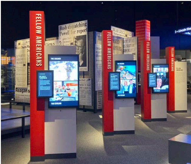
The Fellow American exhibit transform Soldiers from faceless, one-of-many, figures to unique individuals (above).

The Army and Society Gallery examines the relationship between the Army and the American people. It is here that visitors discover the Army's role in shaping the national character. Key exhibits, such as the Wright Flyer and the AN/FPN-40 Radar set, illustrate the Army's contribution in driving the development of critical technologies, some of which are reflected in our daily lives today.