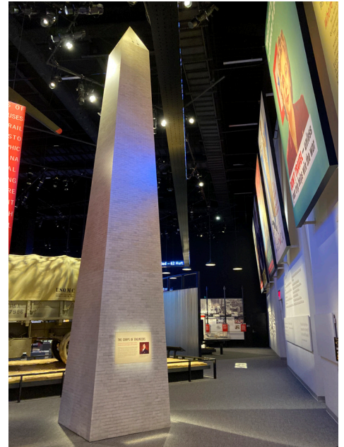
A large-scale model of the Washington Monument serves as a powerful example of the public works the Army has provided the Nation.